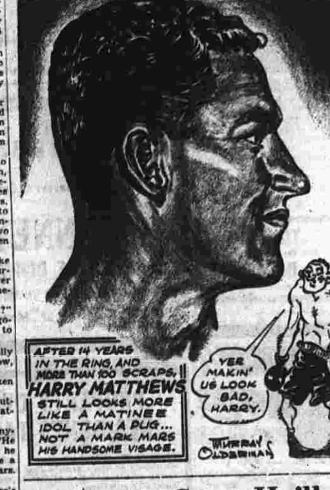
MATTHEWS SURE HE'LL KNOCK OUT MARCIANO